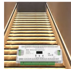
PIR SENSOR STAIR LIGHT CONTROLLER