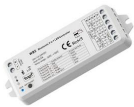
SMART 5 IN 1 CONTROLLER